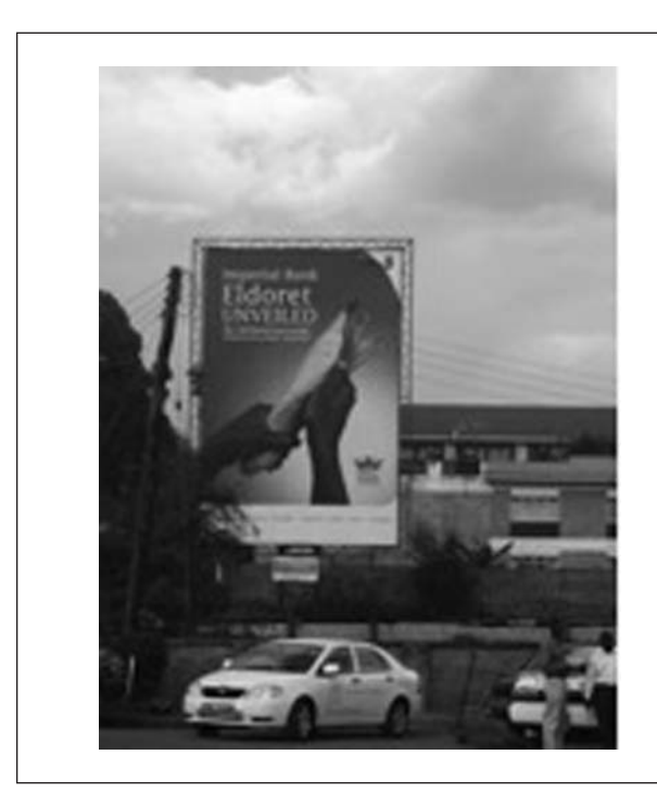
Figure 4. Billboard for Imperial Bank (June 26, 2009)