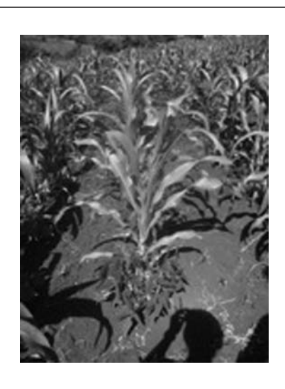
Figure 3. Maize/soy plot (June 21, 2009)